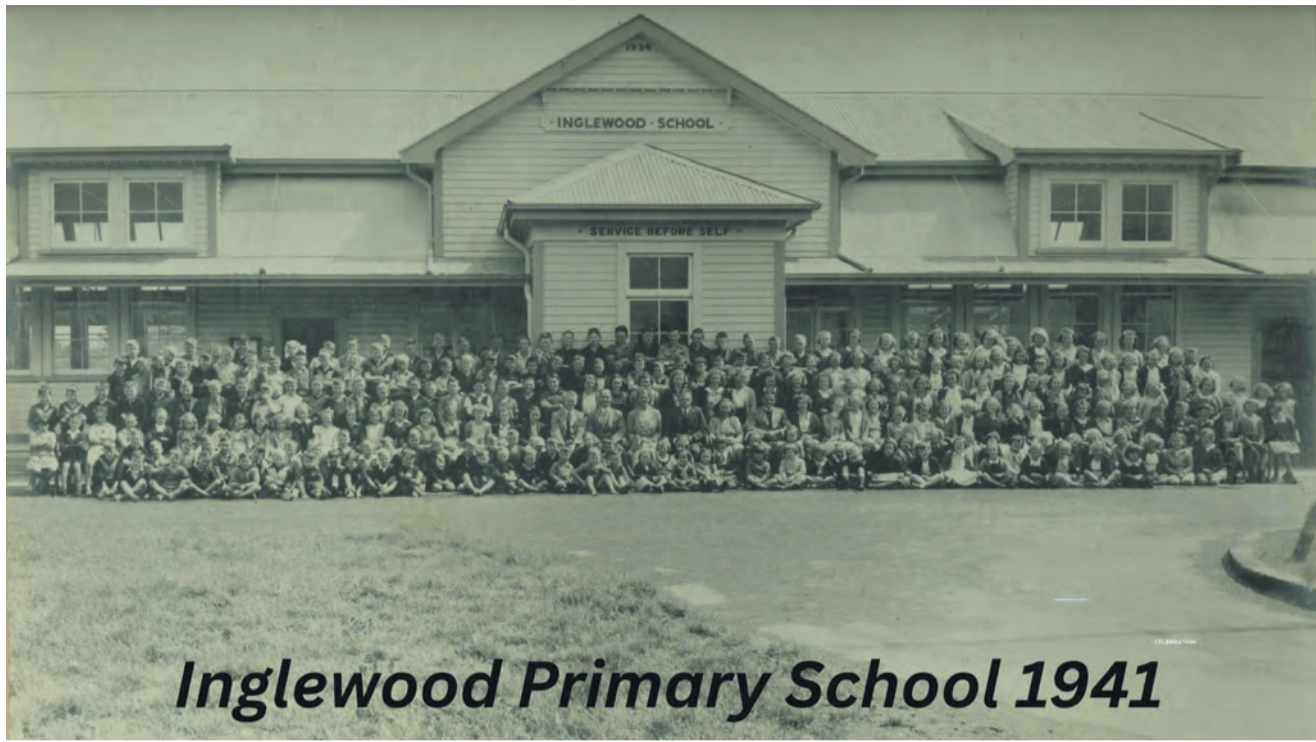
Inglewood Primary School 1941