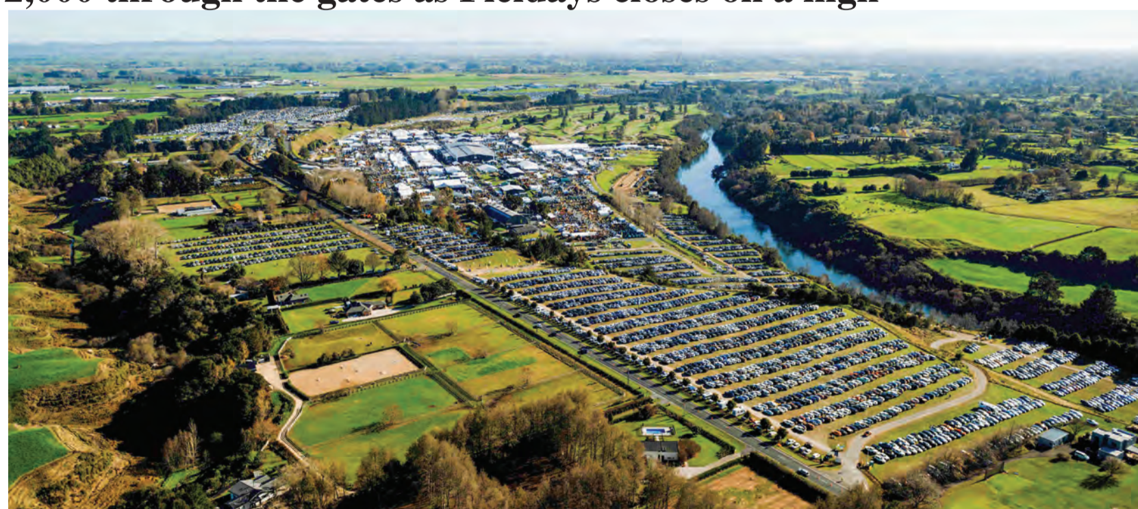
Mystery Creek had the largest opening day attendance in the event's recent history.