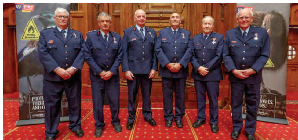
Volunteers are a critical part of Fire and Emergency’s workforce.