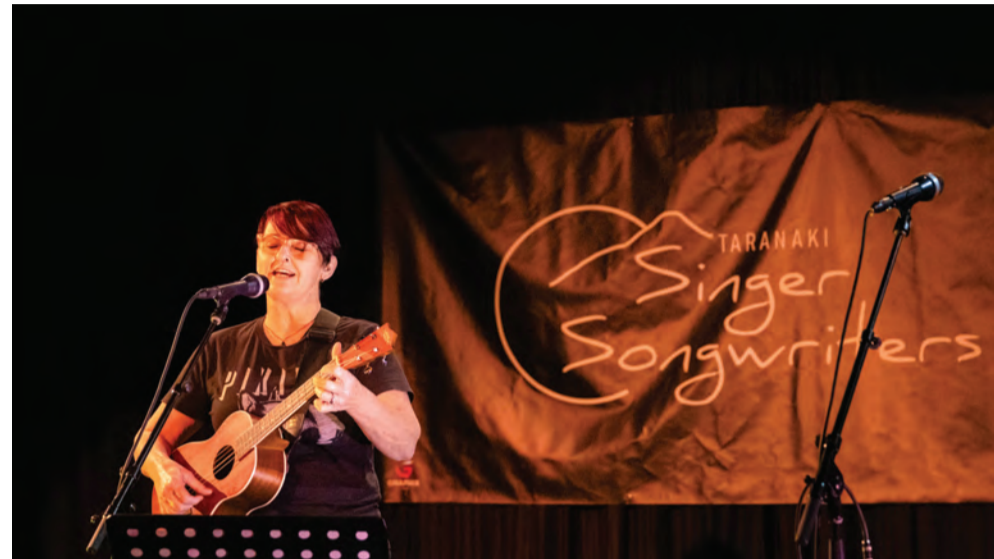
Above, right and below. Taranaki Singer songwriter performers

Whether you are a dedicated music fan, a budding songwriter, or simply looking for a great night out with the community, everyone is welcome to come along and enjoy an evening of original Taranaki music.