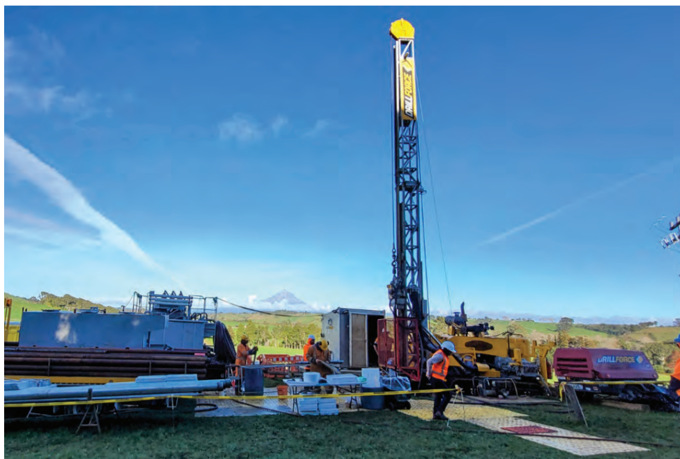
Drilling of the first bore down to an aquifer has begun near Lepperton.

“There’s a lot of population growth around the Glen Avon and Bell Block areas, and all the areas north of the city are supplied by the eastern feeder trunk main.