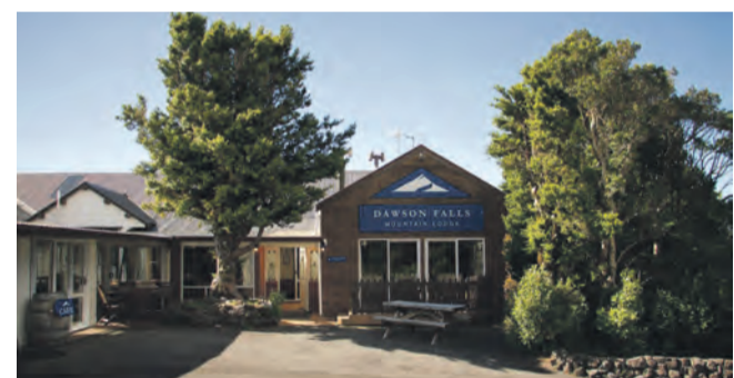
Dawson Falls Accommodation Lodge before it was demolished.