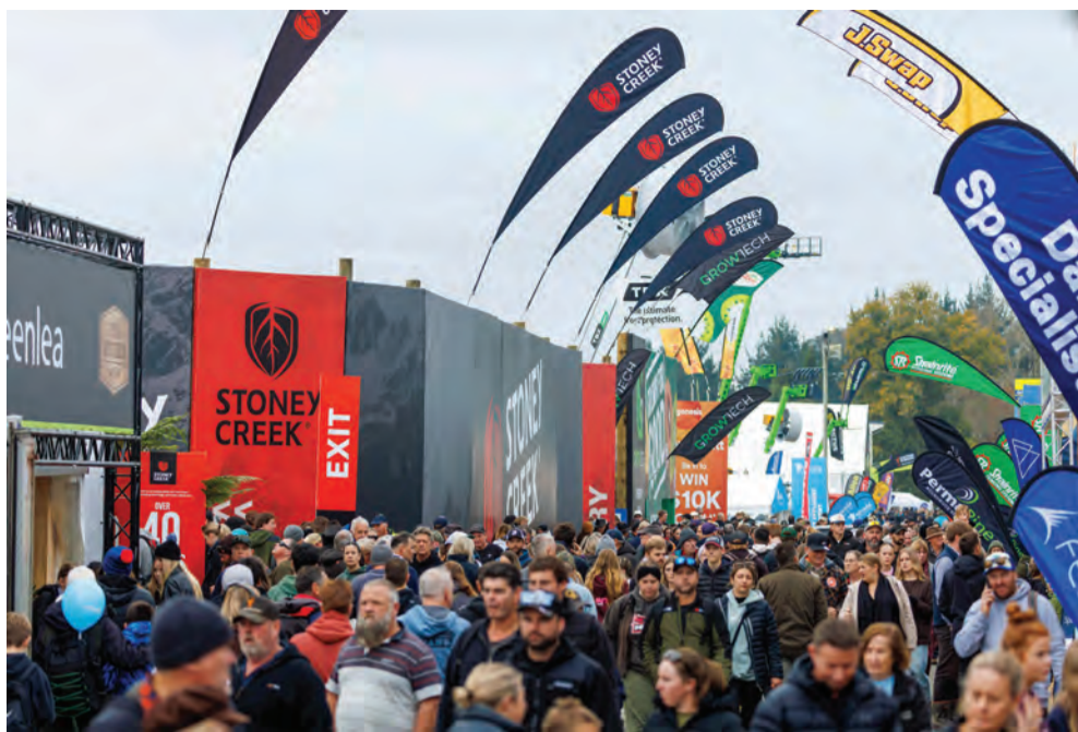
Good weather and a buoyant rural sector has delivered an outstanding Fieldays.