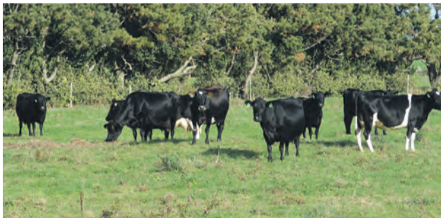
Happy organic cows.

Janet currently has a staff of 3 full time and 2 casual employees across two organic OAD farms and a runoff, as there is less time spent milking – the process is usually completed by about 3pm unless there are