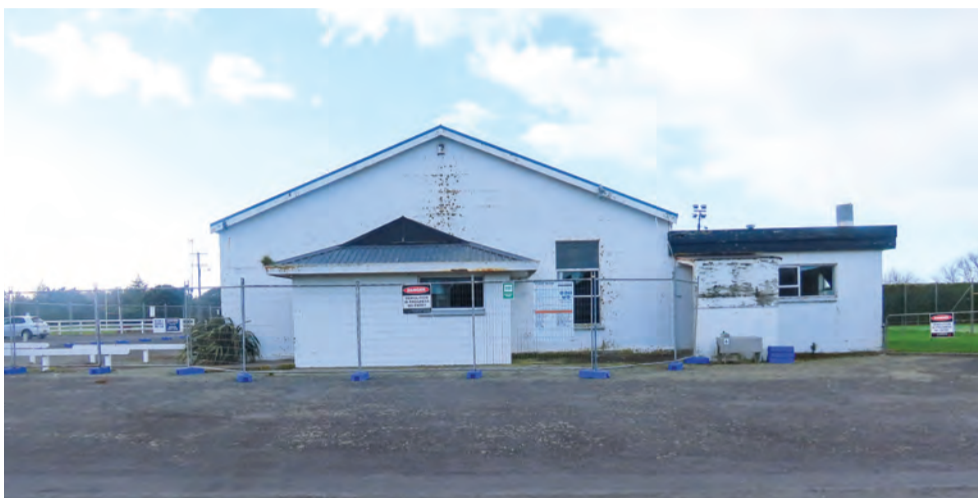
Going...going. The clock is ticking for the Manaia and Districts War Memorial Hall (top) and the Manaia Sports Complex (below).

clubs had gone from the Sports Complex. scene with the loss of the