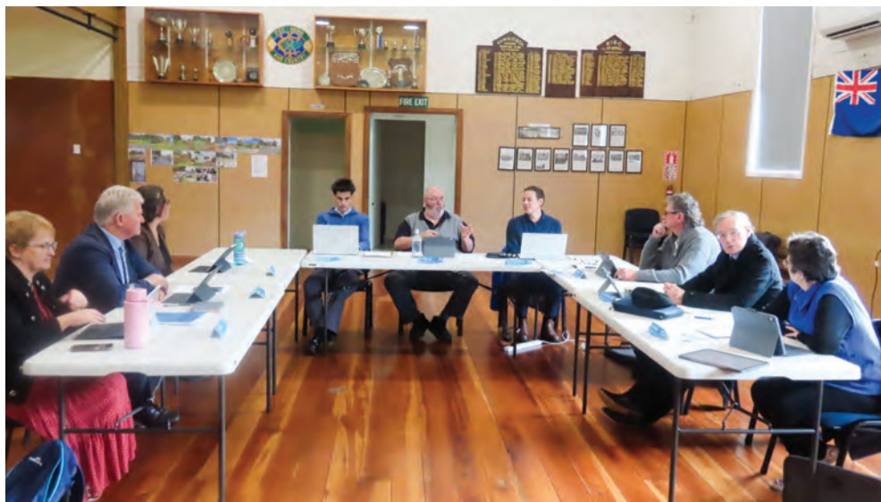
The 125-year-old Rawhitiroa Hall was the venue for the latest meeting of the Eltham-Kaponga Community Board.