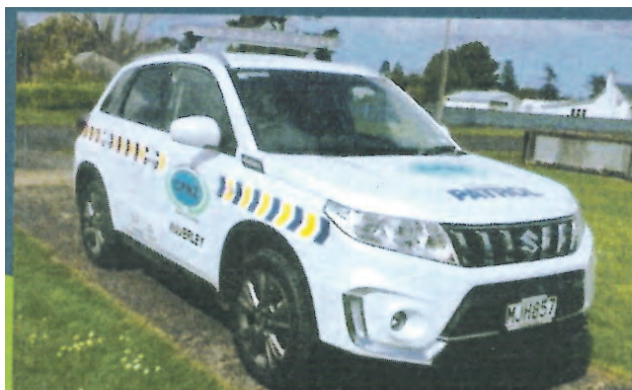
The identifiable community policing vehicle that would be supplied.

Opunake Community Patrol will be part of a nationwide community patrol organisation.