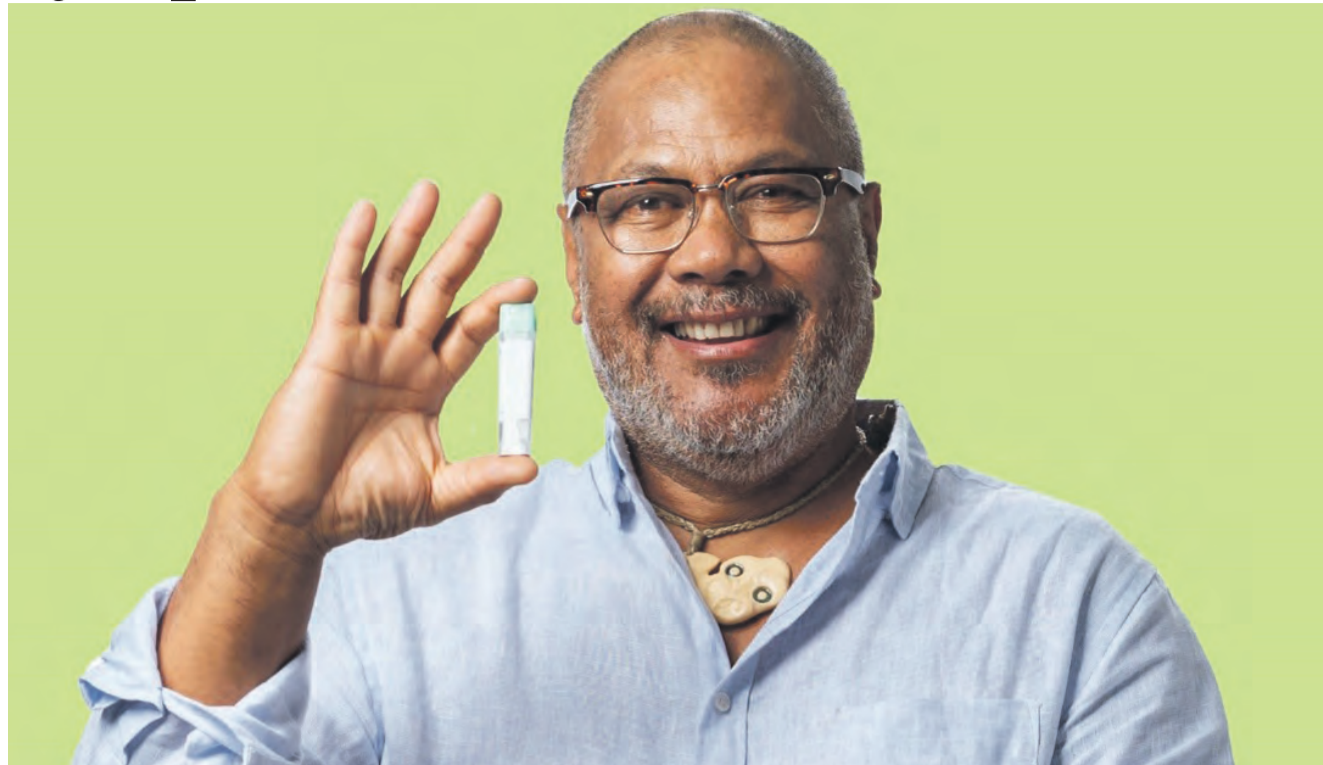
One in four kiwis can't name a bowel cancer symptom as awareness month launches

Too many New Zealanders still don't know the symptoms of bowel cancer – despite it remaining one of the country's deadliest cancers.