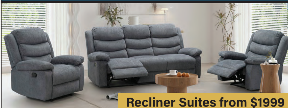
Recliner Suites from $1999