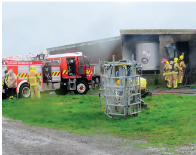
The Opunake Fire Service attending the fire in the milking shed.

A fire in a milking shed was quickly extinguished by the Opunake Fire Service on a callout on Friday June 5 at Kaweora Road near Opunake at around 10:30am. The driving rain did its bit to help drench the fire that was close to the milk vat, but it took the efforts of the fire service to extinguish the fire which could have engulfed the entire milking shed. As if fighting fires wasn't enough the helpful members of the voluntary Opunake Fire Service then had to lend their collective might to help dislodge the reporter's car which had got stuck in the mud. All in a day's work.