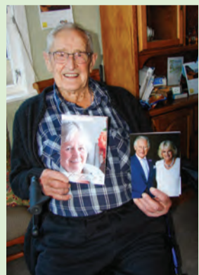
Century celebrated. And still driving. Page 14.