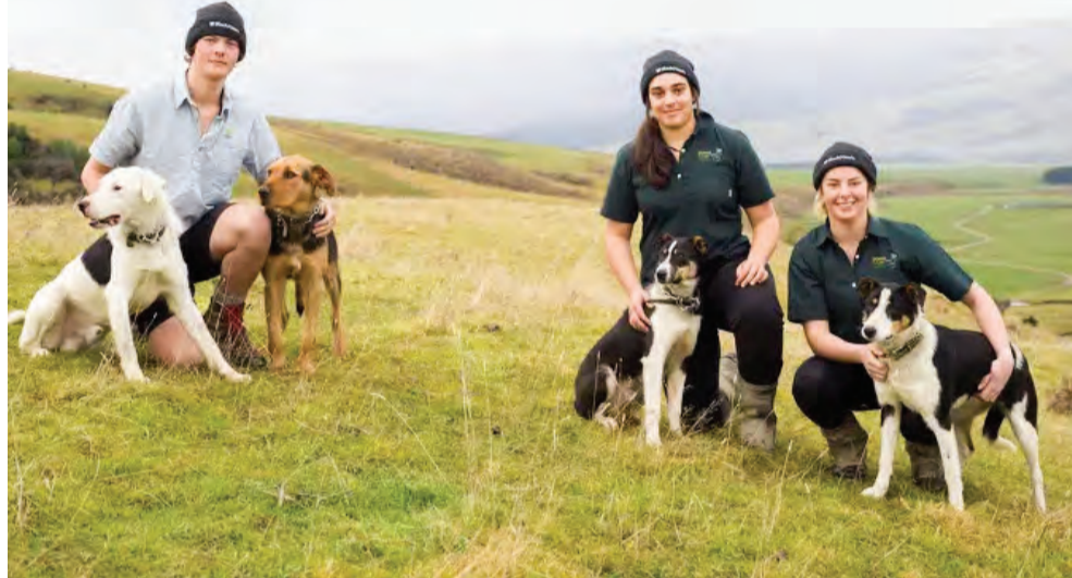
Creating a Rural Wellbeing Champions Programme.

“This Government’s mental health plan is delivering faster access to support, more frontline workers and a better crisis response.”