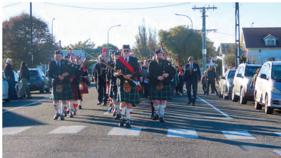
The Civic service begins with a pipe band-led parade.