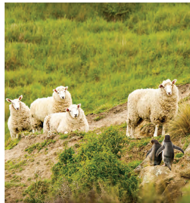
Curious sheep observing two little yellow penguins.