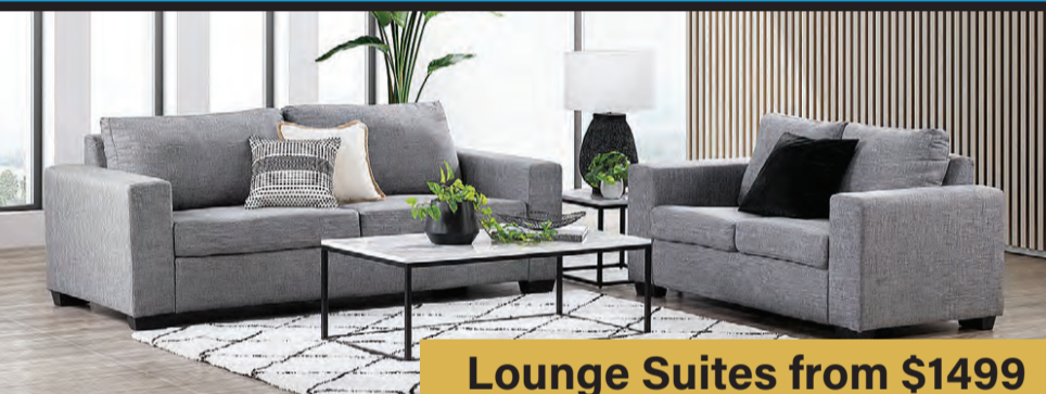
Lounge Suites from $1499