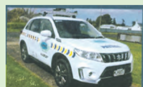
Does Opunake need a community patrol? Public meeting Friday June 26, 1:00pm. P37.