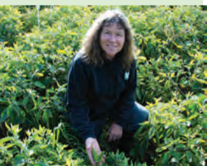
A cure all organic herb from India. Page 31