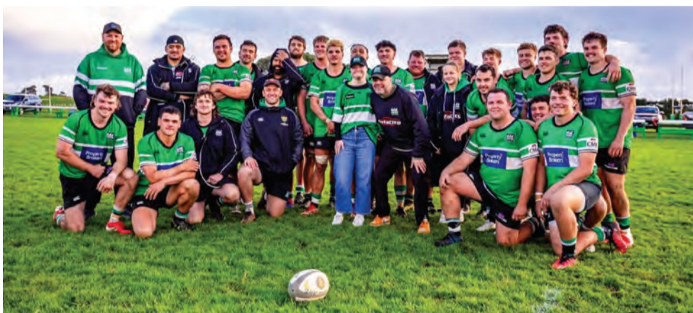
No caption supplied.

we made some adjustments to our forward pack. Some changes for the backline came towards the end of the second half. Southern came out rearing after half time, and were the first to score in the second half, scoring two tries (one converted,