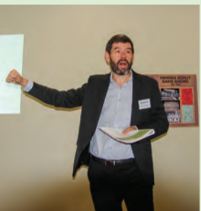
TSB merger - should it go ahead or not? Page 13