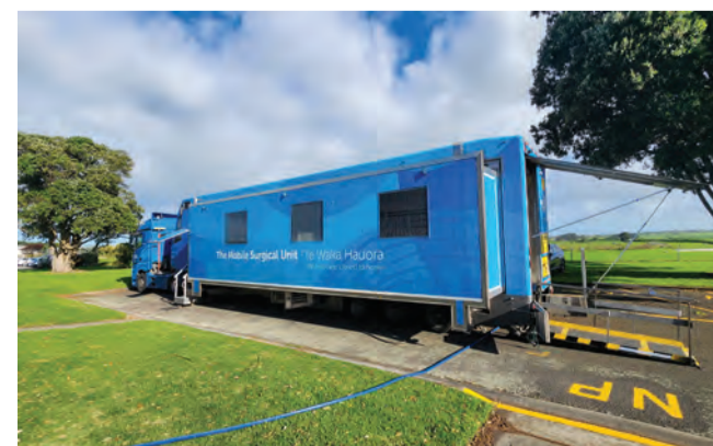
Mobile Surgical. 2000 patients and counting.