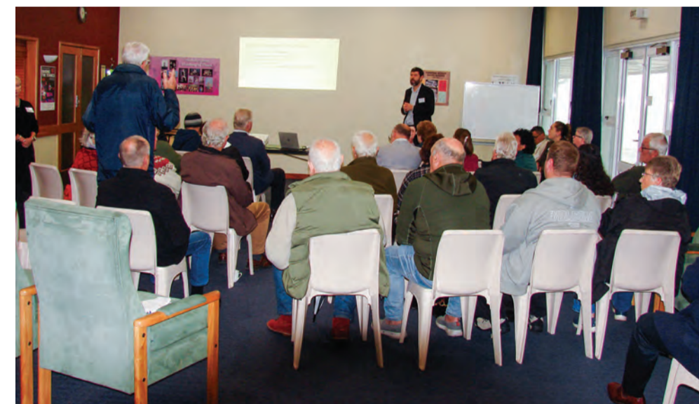
The meeting in Hawera on Friday June 5, which sought feedback on the possible TSB Bank merger with Heartland Bank.