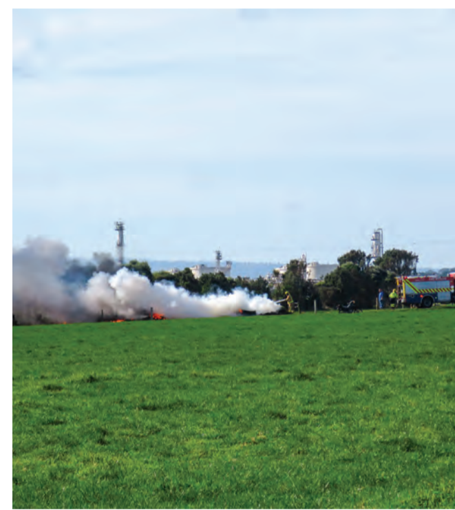
A fire callout on Friday May 22 at 11:20am at Tai Road Oaonui was quickly quelled by the Opunake Fire Service. It seemed to be some silage that had caught fire. The smoke from the burning tyres on top could be seen for miles creating quite a spectacle.